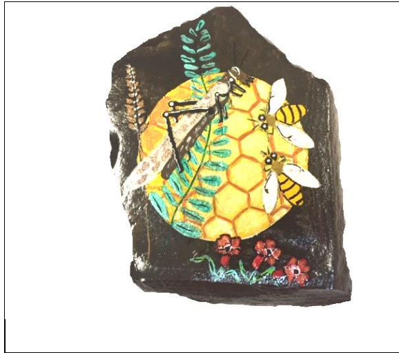
St. John in the Wilderness Anglican Church, Bright's Grove