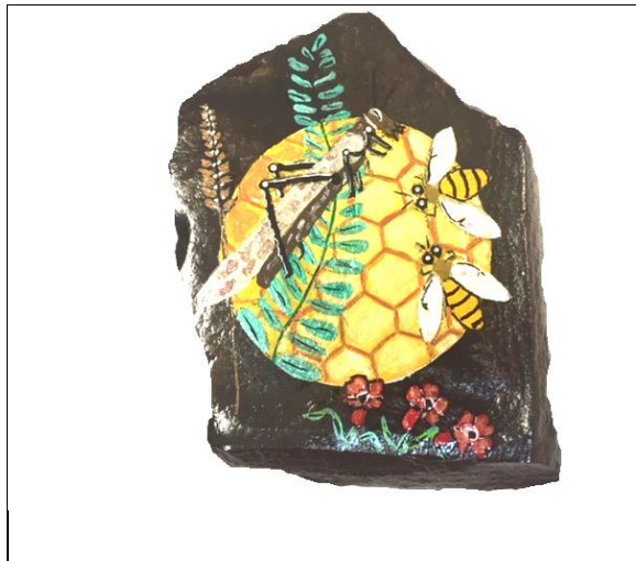
St. John in the Wilderness Anglican Church, Bright's Grove