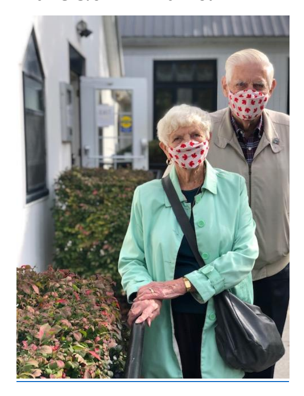
Last issue I asked who planted the marvelous bushes in front of the church

2896 Old Lakeshore Road Bright's Grove, ON Telephone: 519-869-2403