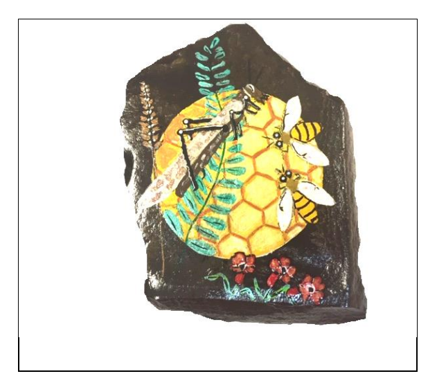
St. John in the Wilderness Anglican Church, Bright's Grove