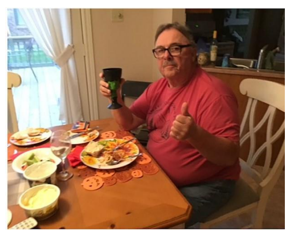
"Delicious Pasta Dinner. No cooking and very little clean up. My kind of meal! Sent from mama Clingy (Brenda)"

2896 Old Lakeshore Road Bright's Grove, ON Telephone: 519-869-2403