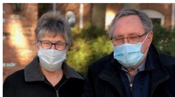
Such Smiles while feeding Sarnia's Hungry.