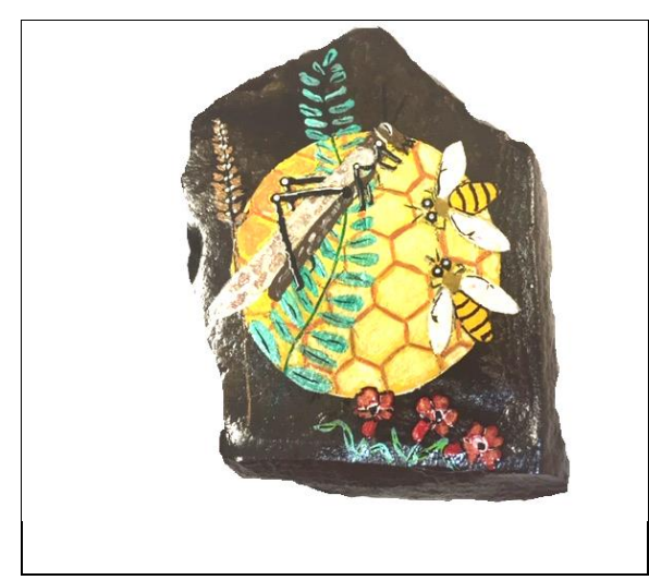
St. John in the Wilderness Anglican Church, Bright's Grove