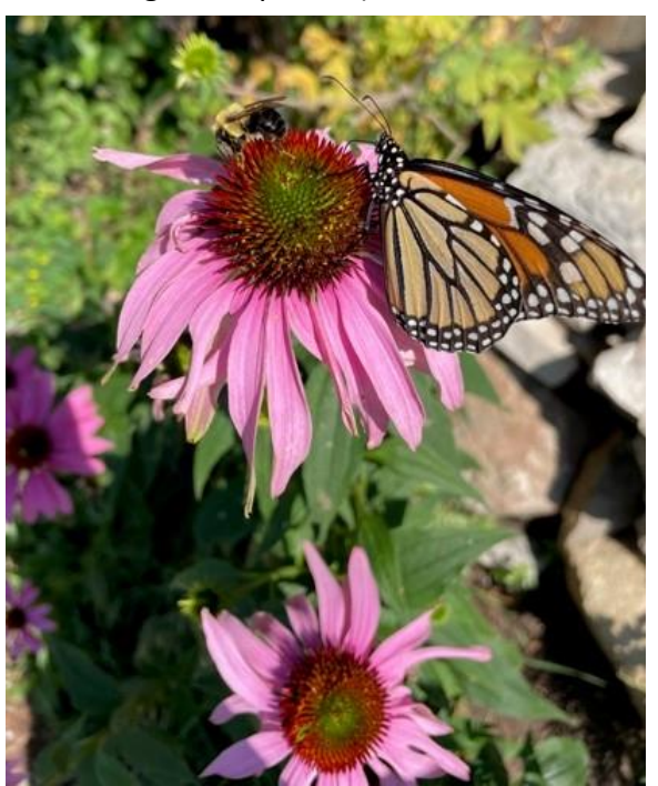
So basically, a couple of improvements enabled and led to other great things ... blessings are bountiful!

small area covered by myrtle. We will also plant grass or sod a small area (where Blair is standing in the picture).