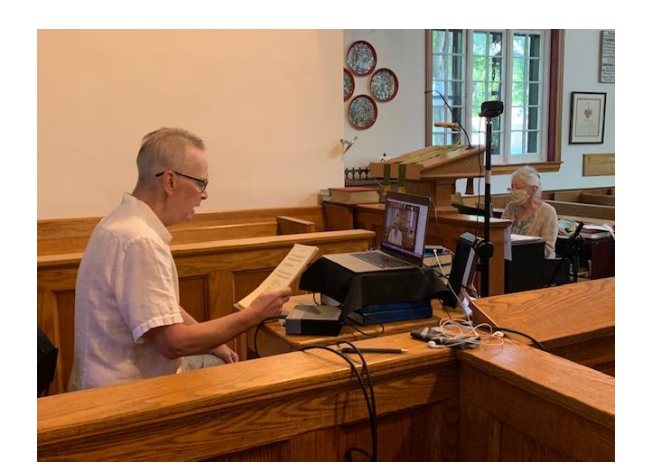
As Covid restrictions have relaxed, our ability to use our building is slowly increasing. During the week, we ask that you keep visits to the church to only essential trips. There should be 10 or fewer