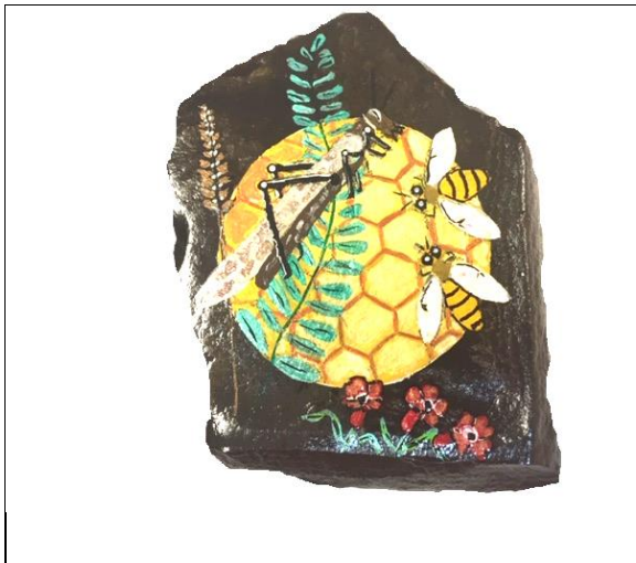
St. John in the Wilderness Anglican Church, Bright's Grove