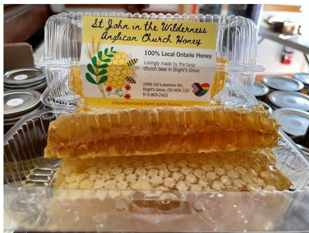
1 - Honeycomb straight from our hives. Mmmmm, good!