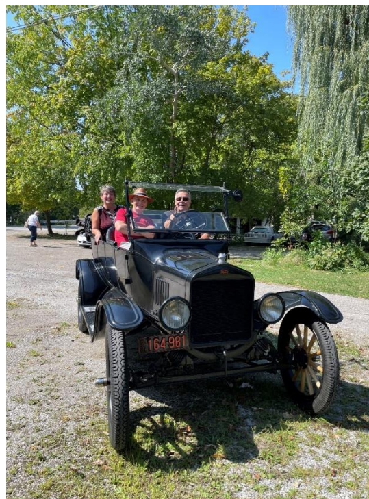
3 - A Ford Model T showed up at the sale and took a few folks out for rides - this car is over 100 years old! Perhaps the subject of a future Honey & Locust article.

& Locust I will explain how a "queen excluder" works and where bees keep their honey.