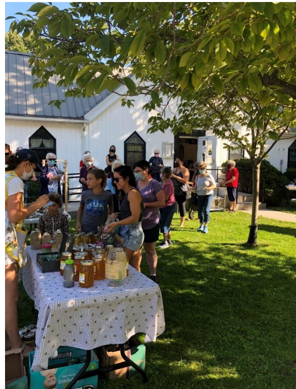
6 - Line-up at the cash...it is nice to see folks at the church again!