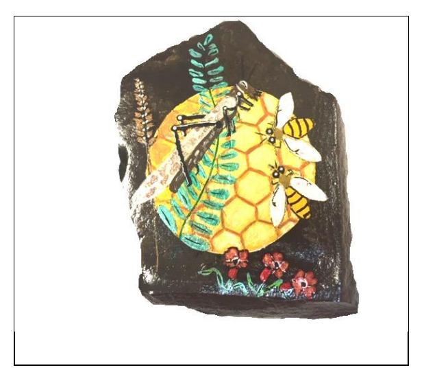
St. John in the Wilderness Anglican Church, Bright's Grove