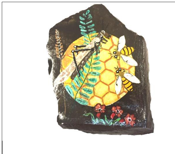
St. John in the Wilderness Anglican Church, Bright's Grove