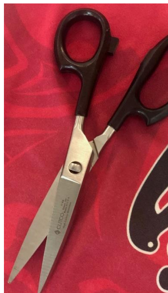
Great Church Community

ago that I could not figure what to do with other than cut things like wire and bushes...where kitchen shears. Tough as nails, come apart at the screw in a second for washing. What memories and what a deal, Brenden!