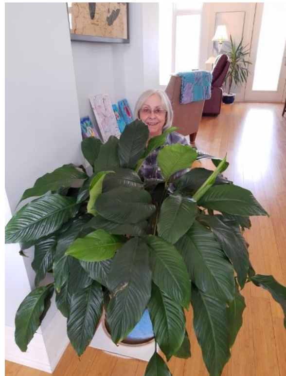
Patty Peace Lily