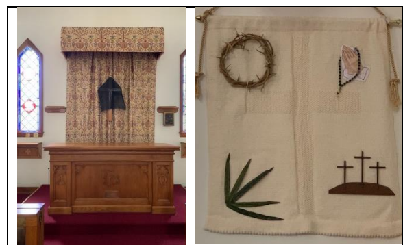
Good Friday above and Easter Sunday below.

Here are pictures of the Holy Week services.