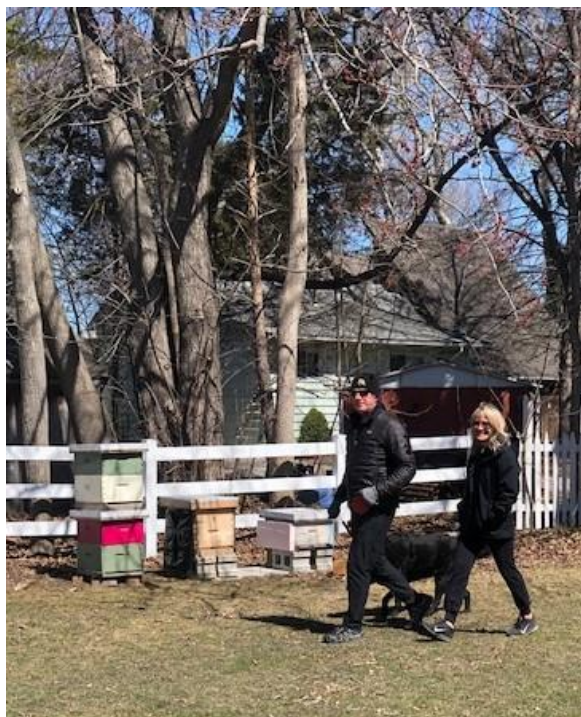
Above, some neighbours walking past, a common joyous site on our property.